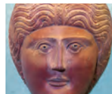
Head Pot One of the best examples of a Roman head pot