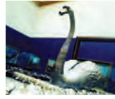
The Silver Swan A magnificent 18th century working automaton