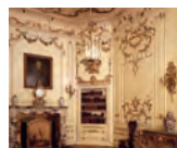
Panelling from Chesterfield House A fine example of English Rococo decoration