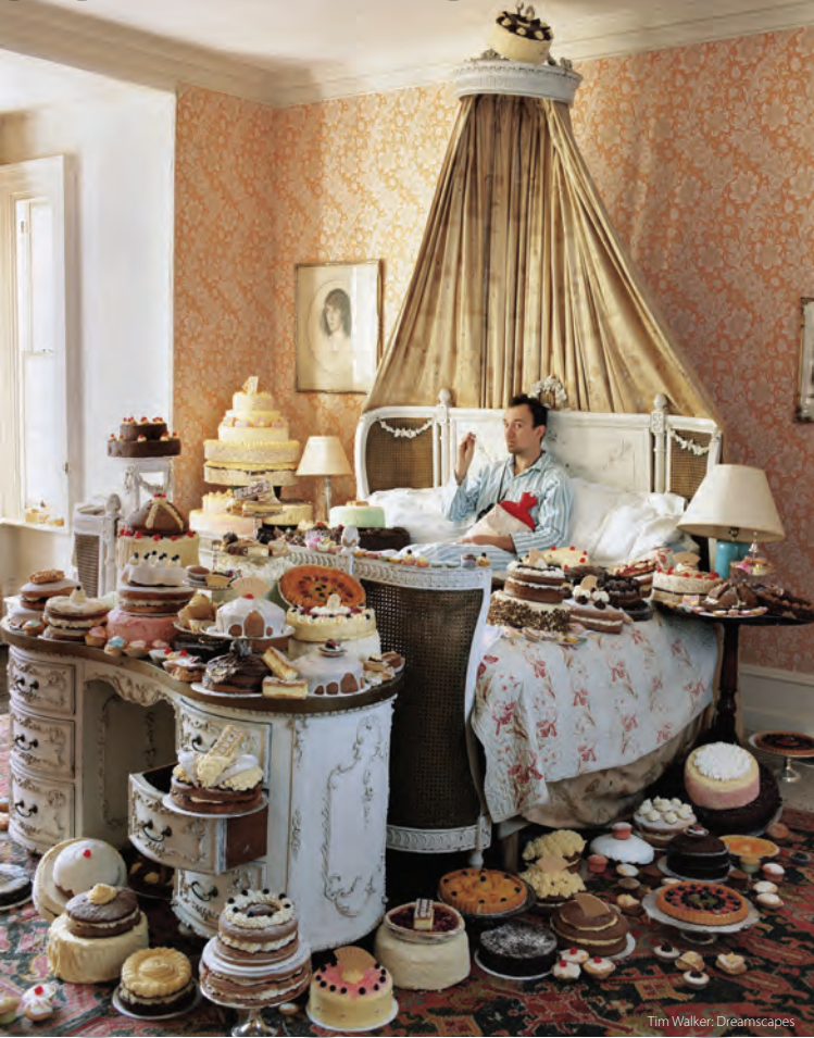
Tim Walker: Dreamscapes