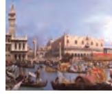
Paintings by Canaletto Two masterpieces by the celebrated Venetian artist