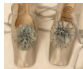
Evening Shoes Worn by the Empress Eugénie, wife of Napoleon