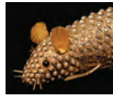
Clockwork mouse Purchased by Joséphine Bowes in 1871